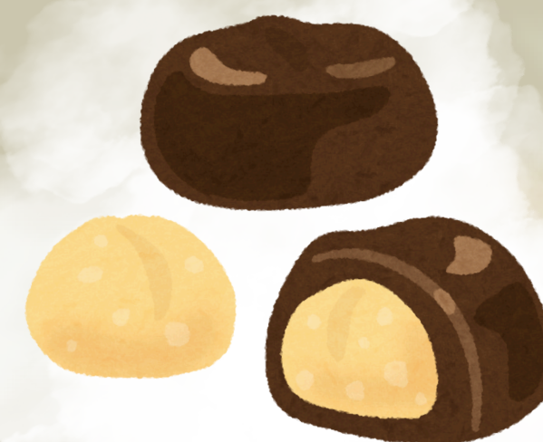
Peanut Butter Balls