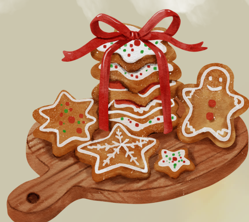
Cookie Decorating Kits

Regular Sized $5.50 or Choice Assortment of 4/$20.00 Mini Loaves $3.25 each or Choice Assortment 4/$12.00