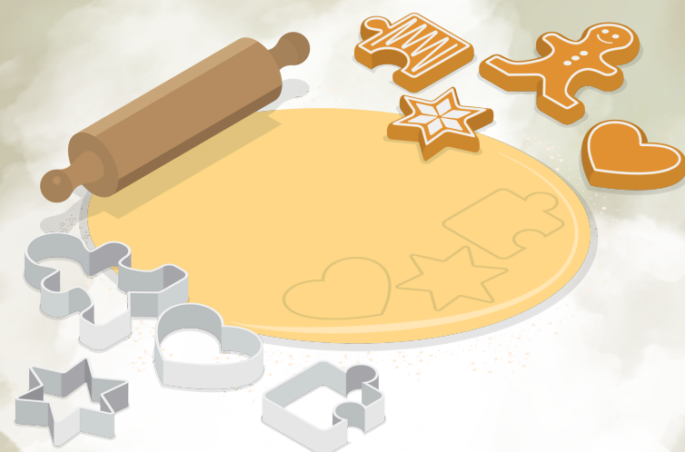
Unfrosted Cut-out Cookies

Assortment (4 of each from above) $8.50 Per Dozen (12)