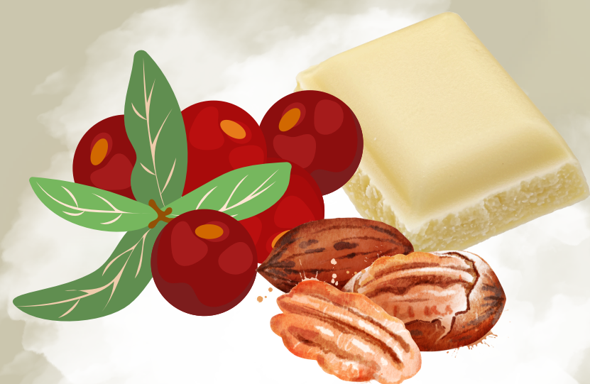
Cranberry/Pecan White Chocolate Clusters